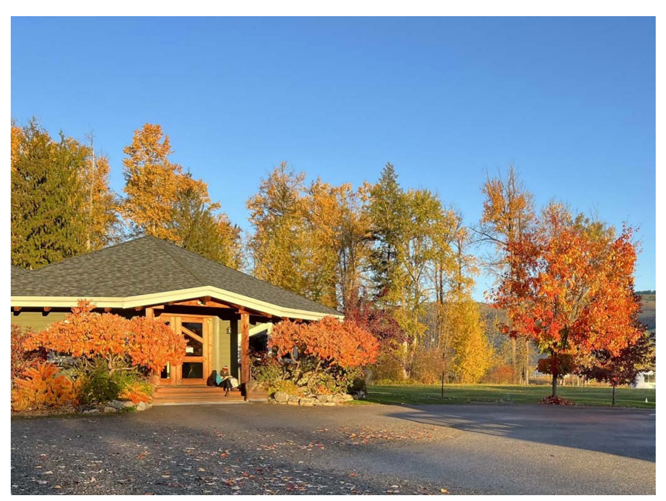
View of the original school building. This special building is now one of many on the OWS campus.

Monday - Friday 9:00AM to 3:00PM (July - August)